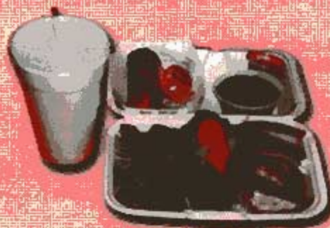
Teriyaki Chicken & Beef