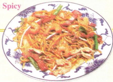
House Special Lo Mein