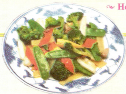
Mixed Chinese Vegetables