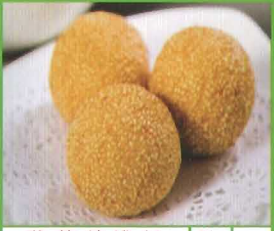
蓮蓉煎堆仔 Qty. Crispy Sesame Seed Ball