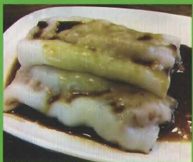
牛肉腸粉 Qty. Beef Rice Paste