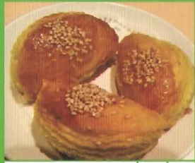
叉燒酥 Qty. Baked BBQ Pork Pastry