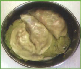
菜餃 Qty. Steamed Vegetable Dumpling