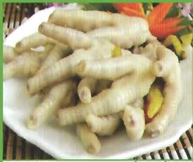
白雲鳳爪 Qty. Cold Chicken Feet