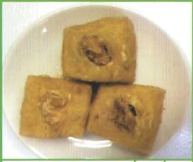
百花炸釀豆腐 Qty. Fried Stuffed ToFu w. Shrimp