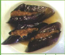
釀茄子 Qty. Stuffed Eggplant