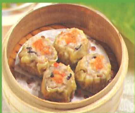
干燒賣 Qty. Siu Mei