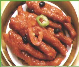
豉汁蒸鳳爪 Qty. Steamed Chicken Feet