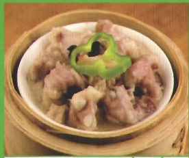
豉汁蒸排骨 Qty. Steamed Ribs w. Black Bean Sauce