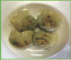
煎韭菜餃 Qty. Pan Fried Chive Dumpling