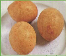
家鄉咸水角 Qty. Fried Mixed Dumpling