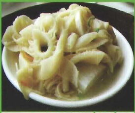
牛柏葉 Qty. Steamed Beef Tripe