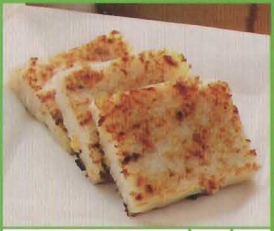
臘味蘿卜糕 Qty. Pan Fried Turnip Cake