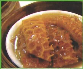
豉汁牛肚 Qty. Steamed Beef Stomach