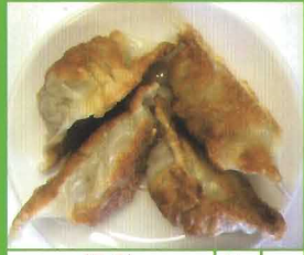
鍋貼 Qty. Pan Fried Dumpling