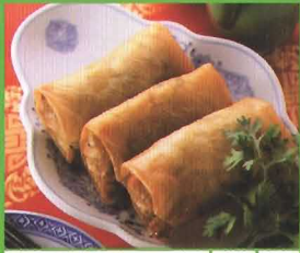
上海春卷 Qty. Spring Vegetable Roll