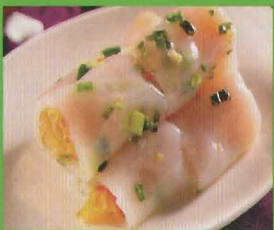
炸兩腸 Qty. Fried Flour Stick Rice Paste