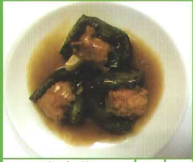
釀青椒 Qty. Stuffed Pepper