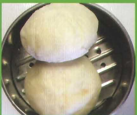
蒸蓮蓉飽 Qty. Steamed Lotus Seed Bun