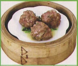
西菜牛肉 Qty. Beef Ball