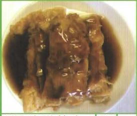
蚝油鮮竹卷 Qty. Stuffed Bean Curd Skin