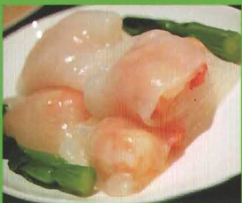
鮮蝦腸粉 Qty. Shrimp Rice Paste