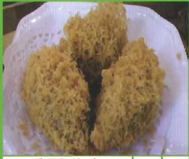
香酥芋角 Qty. Roast Pork Taro