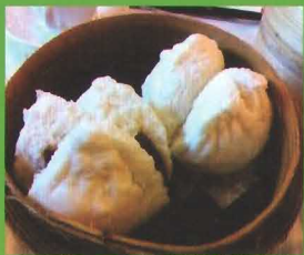
蒸叉燒飽 Qty. Steamed Roast Pork Bun