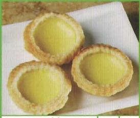
蛋撻 Qty. Egg Custard