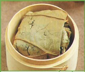
糯米雞 Qty. Sticky Rice